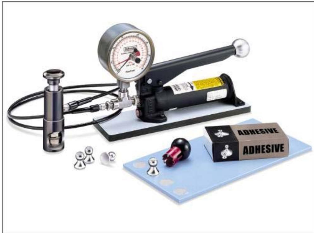
Figure 2 – PosiTest AT-M Adhesion Tester

Degreasing refers to the removal of any trace oils or grease from the surface to be bonded. This may include oils from the skin of the person handling the dolly. Abrasion is an aggressive alteration of the profile of the dolly surface. Abrasion serves two primary purposes: to increase the available surface area for bonding, and to remove any oxidation or rust. Cleaning is simply the removal of any loose particles from the surface to be bonded, particularly those created by abrasion.